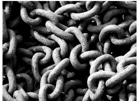
Monochrome Print by Charles Leverett